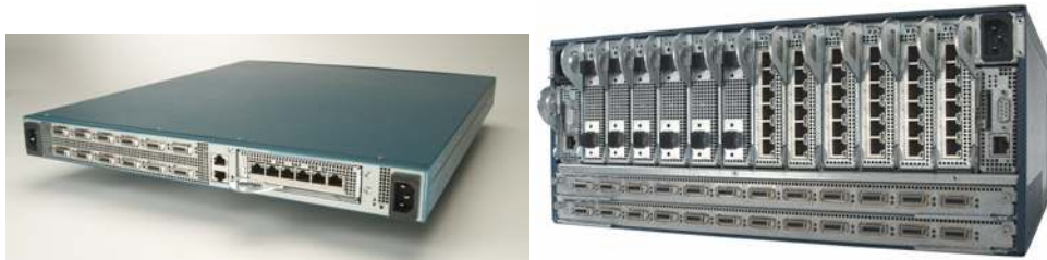
Figure 3. Cisco SFS 3001 and 3012 Rear Views

The Cisco SFS 3001 also meets high-availability requirements with redundant, hot-pluggable power and cooling. The optional expansion module is also hot-pluggable. Multiple Cisco SFS 3001s can also be deployed in redundant pairs to prevent single points of failure at the system level.